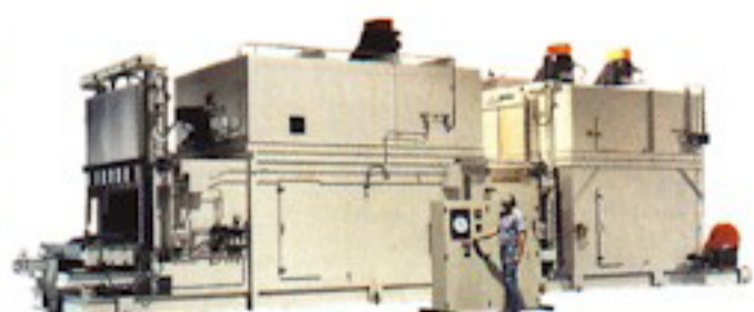
WIRE REEL ANNEALING OVEN