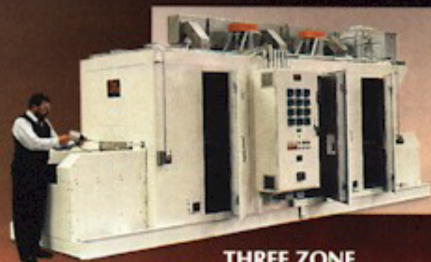
THREE ZONE PORTABLE LAB OVEN

Whether you're launching a new product or simply looking for a more efficient production method, Lanly's heat processing expertise can help ensure success. Our "can do" approach isn't a boast – it's reality founded on the widest range of experience in the business. Lanly is a team of experts that stand on the leading edge of the technology ready to help optimize your capital equipment investment.