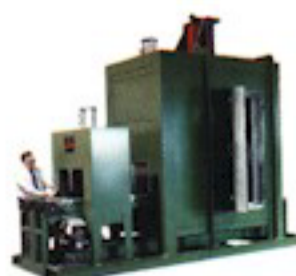
PARTS DRY & COOL PROCESS OVEN