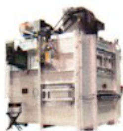
FIBERGLASS CARMEIZING OVEN