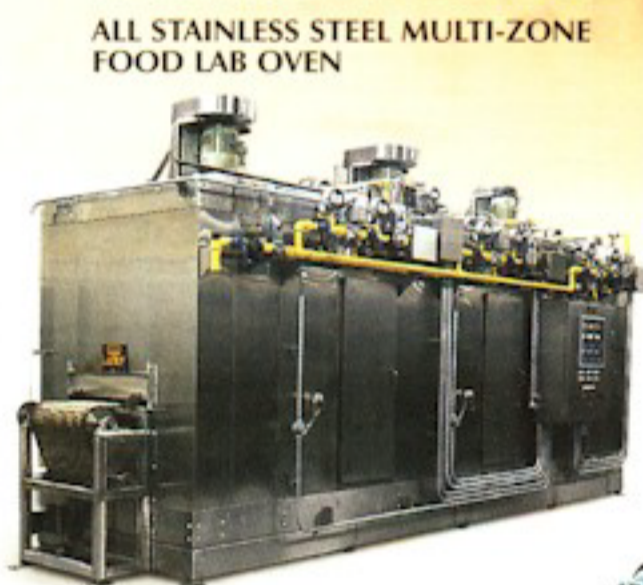
ALL STAINLESS STEEL MULTI-ZONE FOOD LAB OVEN