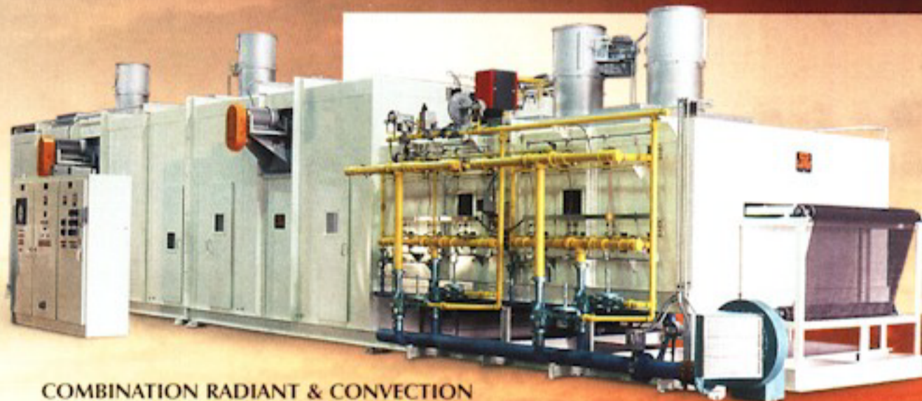
COMBINATION RADIANT & CONVECTION SPECIAL PRODUCT FOOD OVEN

Give us your exacting specs or merely outline your desires for a unique end product... the Lanly engineering team will design and build the perfect solution.